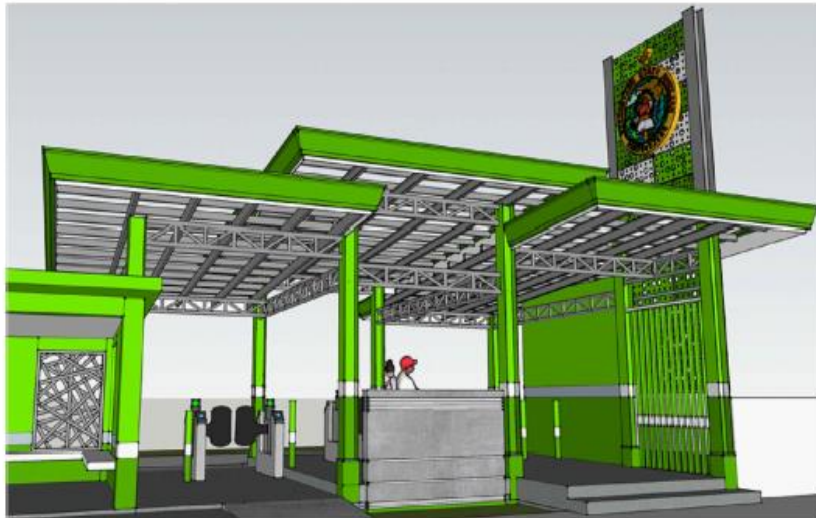
3D STRUCTURAL FRAME @ FRONT SCALE: NTS